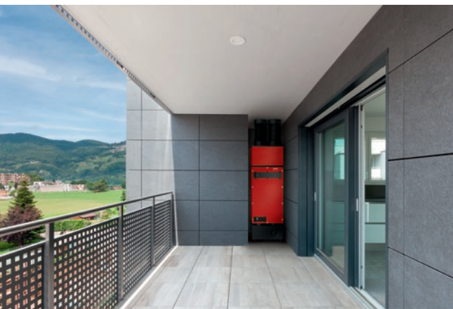
The HomeVent® comfort ventilation units can be installed flexibly, e.g. also outdoors on the balcony.

With the controller, you do not only operate your HomeVent® comfort ventilation, but also your Hoval heating or hot water preparation.