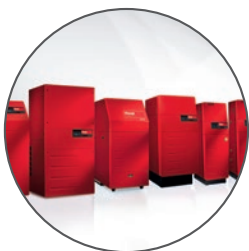
Hoval heat generators

Hoval supplies all components for an efficient heating and room air system. The Hoval TopTronic® E system controller combines all components into an efficient overall system. This solution ensures you are provided with standardised operation and matching components.