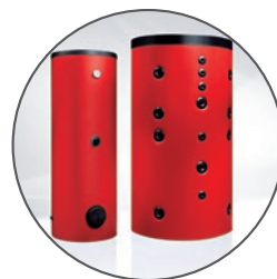
Hoval storage tanks