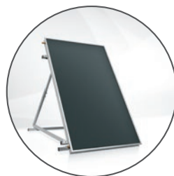
Hoval solar plant