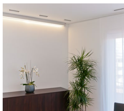
The HomeVent<sup>®</sup> system offers a wide range of stylish design grilles for supply and extract air. Ask for the brochure "HomeVent<sup>®</sup> design grilles".